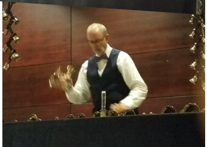
Beautiful and meaningful Chapel service.