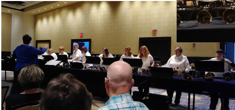
Classes were excellent, filled with new ideas.