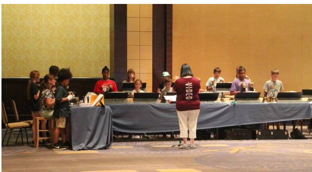
Came home with some great ideas to share with my choir.