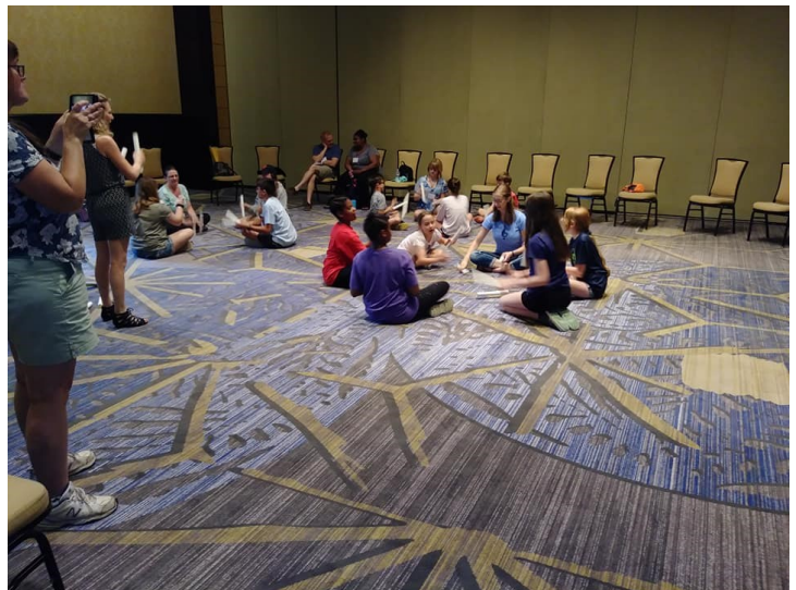
.....such as Maori Sticks with the Young Ringers