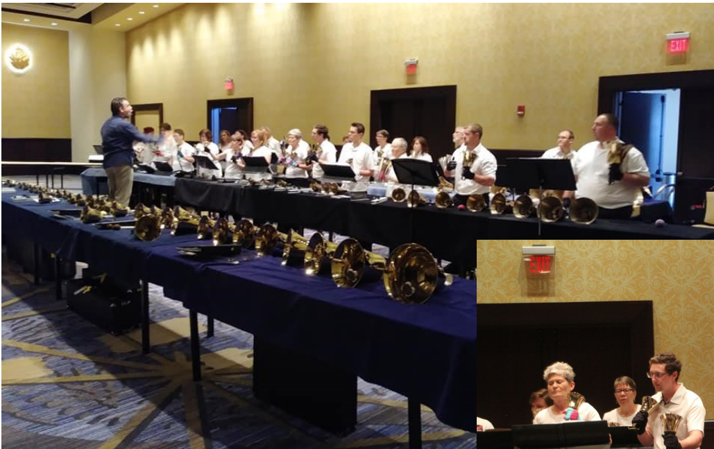
Awesome directors and teachers!